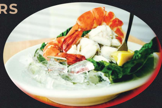
COLOSSAL SHRIMP & CRABMET COCKTAIL